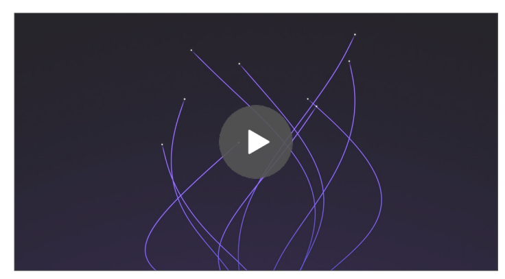
IBM Watson: Revolutionizing Business in the Digital Age

The vast majority of AI failures aren't due to AI models: they're failures in data preparation and organization. Successful AI models first require your collection and organization of data. Simply put: there is no AI without an information architecture (IA). With a unified, prescriptive, and open information approach, organizations can modernize their data architecture to make their data ready for an AI and multicloud world.