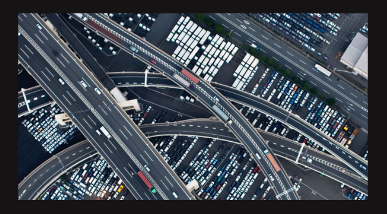
The AI Ladder Learn how to make your data ready for an AI and multicloud world. \rightarrow