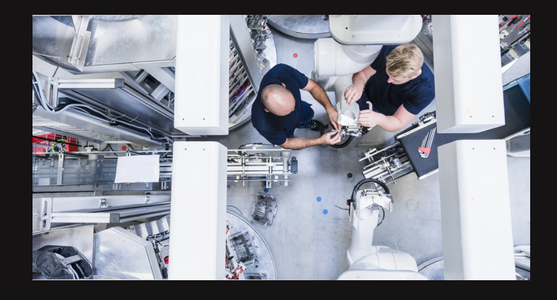
Visit a garage location Innovation from concept to reality with speed and impact. \rightarrow