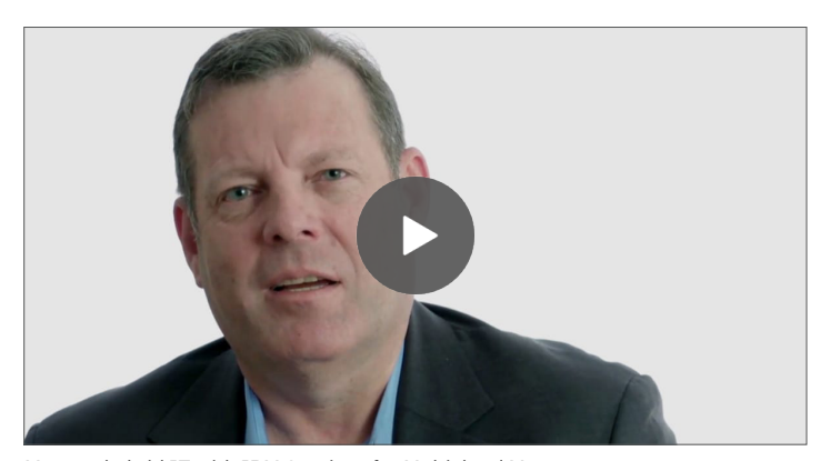
Manage hybrid IT with IBM Services for Multicloud Management

Effective IT management requires integration across your enterprise, and the right multicloud solution gives you a clear view of your apps, built-in support for your compliance management, and the simplicity and intelligence of automation.