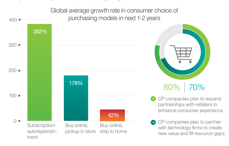
Figure 4 CP companies can leverage their ecosystems to fulfill growing direct-to-consumer demands